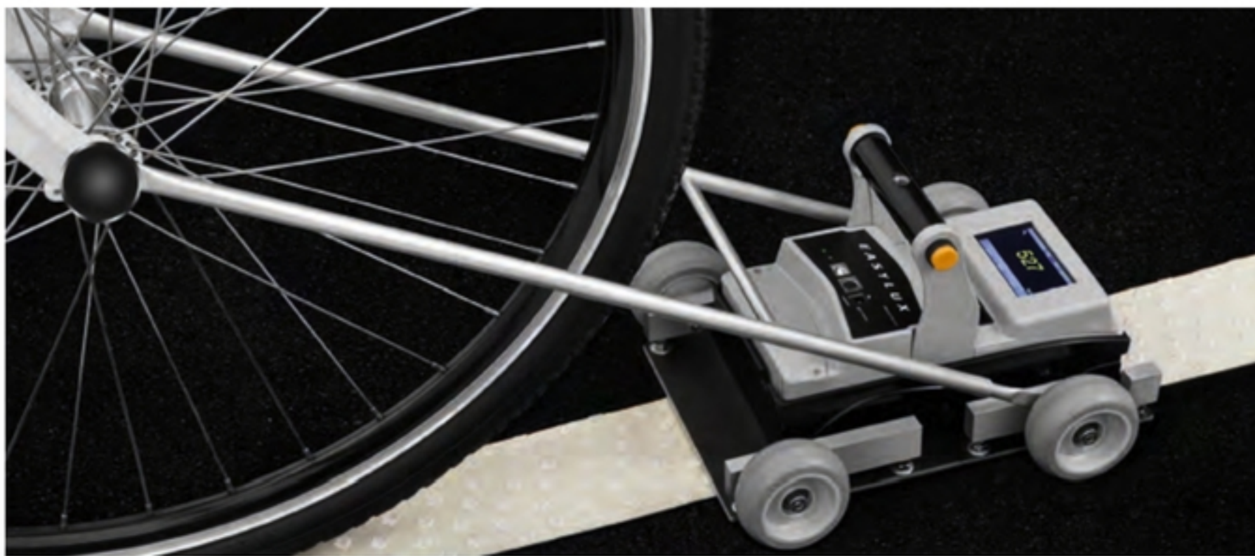
(Left) The Easylux MiniReflecto is so light and portable it lends itself to innovative solutions such as attaching it to a bicycle or tricycle wheel

low-cost airlines, with a significant gain in comfort and savings. Increased portability also means the units are easy for anyone to operate, regardless of physical strength.