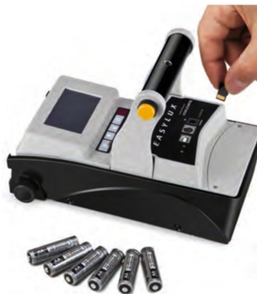
Easylux Road Marking Retroreflectometer: certified to EN1436 by an independent test laboratory

On the other hand, mobile, vehicle-mounted retroreflectometers are an expensive, oversized and impractical solution for routine monitoring services or for evaluating short stretches of roadway.